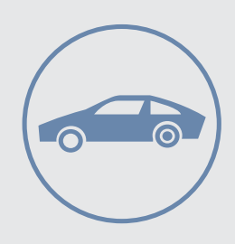
NO DRIVING (day of procedure)